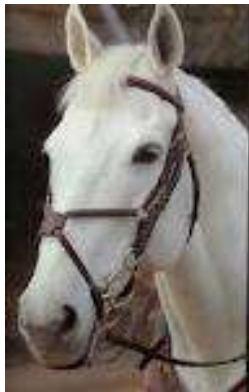
Figure 8 or Grackle Noseband

The noseband aims to prevent the horse from opening his mouth and evading the pressure of the bit.